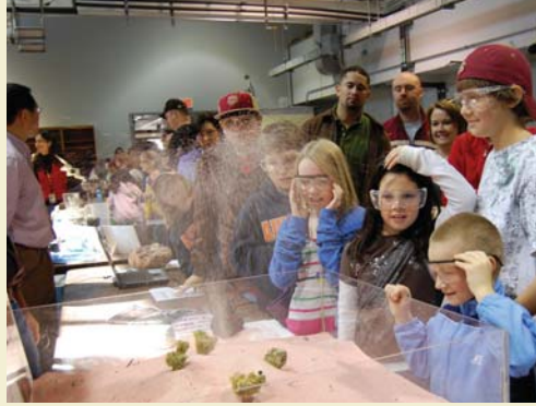
▲ VISITORS OF ALL AGES ENJOY SCIENTIFIC EXPERIMENTS AT THE MAG LAB OPEN HOUSE.

With more than 5,400 people in attendance, The National High Magnetic Field Laboratory reported a successful open house on February 21, 2009 attracting a record number of visitors. Visitors, young and old, participated in a myriad of hands-on experiments and watched scientists shrink quarters, freeze flowers and launch potatoes out of pneumatic cannons. The Magnet Lab also collected more than 2,000 pounds of food for America's Second Harvest Food Bank of the Big Bend.